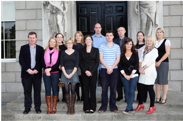
Rannpháirtithe chúrsa 2008 / 2008 course participants

'I was always interested in Irish and I wanted to get an opportunity to work through the medium of the language. I managed to attain a high standard of grammar during the course [in King's Inns] and I now have a one-year contract working as a lawyer-linguist in the Council of Europe. The work is challenging but I'm confident that I'll succeed in learning all the skills necessary to work in this area on a long-term basis.'